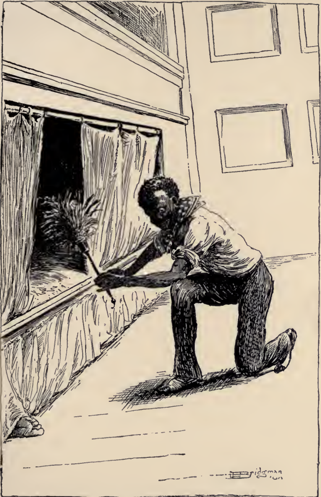
DAVE FINDS MULGRUM UNDER THE BERTH.